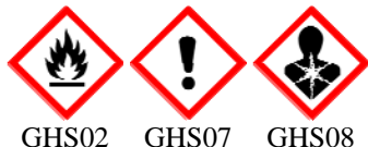
GHS02 GHS07 GHS08