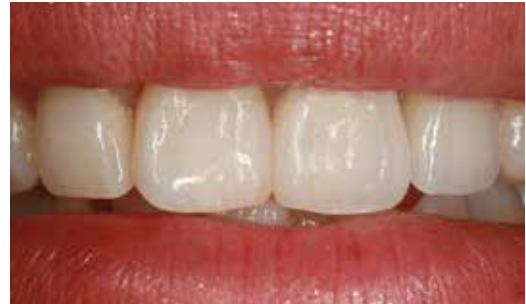
After: All-ceramic crowns on the natural tooth stump (left) and on the implant (right)