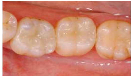
After: Tooth-coloured fillings made of all-ceramics