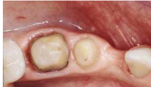
Before: Missing tooth with neighbouring tooth showing caries