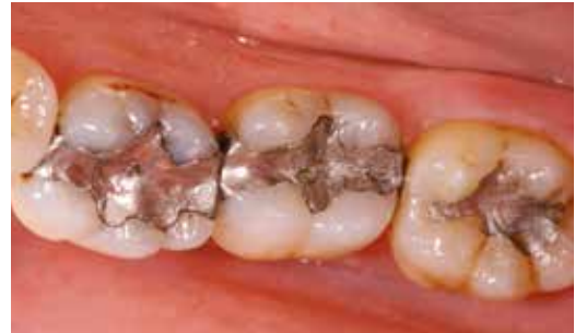
Before: Dark fillings made of amalgam