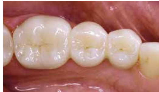
After: "Bridging" the gap with an all-ceramic restoration (bridge).