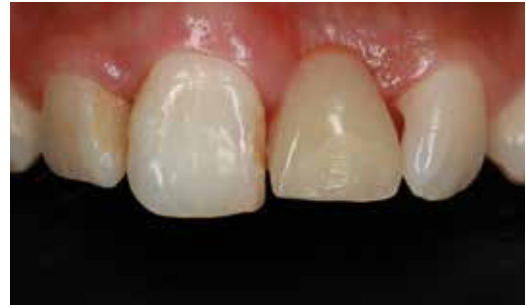
Before: A damaged incisor tooth (left) and an incisor tooth replaced with an implant (right).