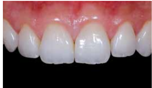
After: Gaps closed with all-ceramic veneers