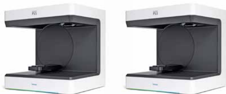
The new laboratory scanners: PS5 and PS3

They are pleasant and simple to use, and combine high precision with true-to-detail scan results. The digital workflow ensures high process reliability, enabling you to save time and benefit from reliable results.