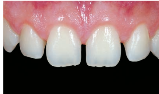
Before: Gaps in the front tooth row