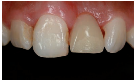
Before: A damaged incisor tooth (left) and an incisor tooth replaced with an implant (right).