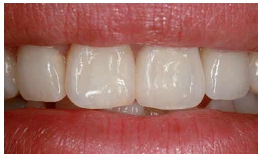
After: All-ceramic crowns on the natural tooth stump (left) and on the implant (right)

Bexi is able to flash a bright smile again: