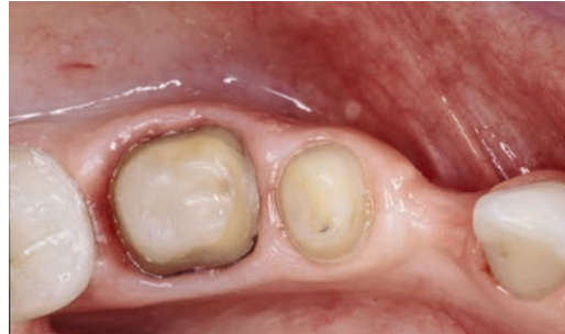
Before: Missing tooth with neighbouring tooth showing caries