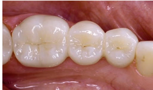
After: "Bridging" the gap with an all-ceramic restoration (bridge).