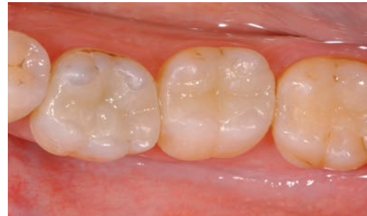
After: Tooth-coloured fillings made of all-ceramics