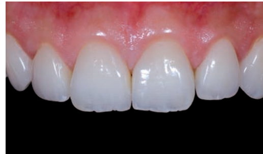
After: Gaps closed with all-ceramic veneers

Lindy's face radiates joy and vitality again: