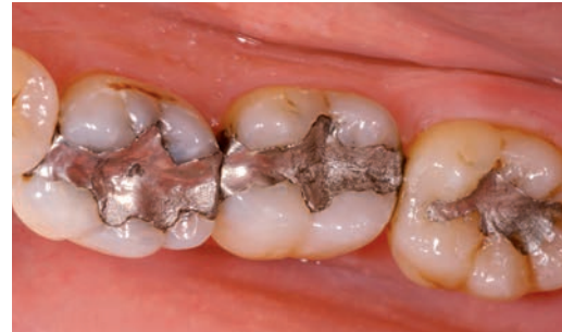
Before: Dark fillings made of amalgam