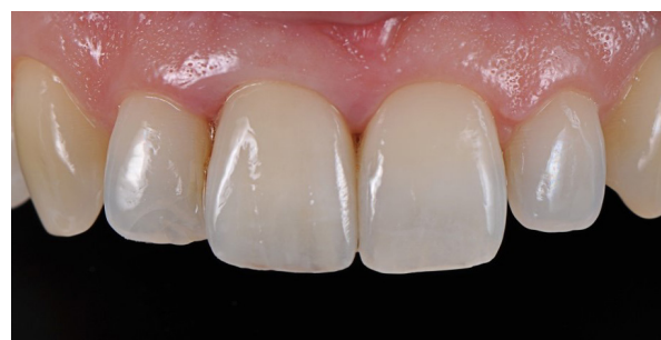
IPS e.max Ceram Power on IPS e.max Press