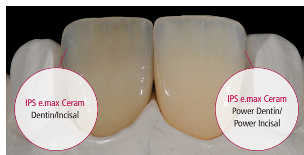
The difference in value and brightness on translucent materials is evident when comparing traditional IPS e.max Ceram to IPS e.max Ceram Power materials.