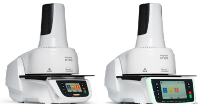
The new Programat press furnaces: EP 5010 G2 and EP 3010 G2

Proven technologies, such as the fully automatic press function (FPF), combined with new features - that is what makes the new Programat press furnace your reliable partner.