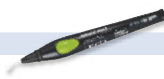
AdheSE® One F