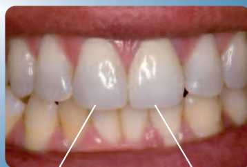
IPS Empress Direct composite veneer