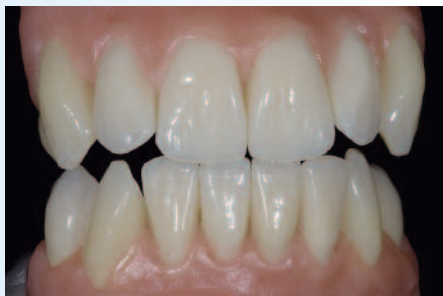
SR PHONARES® NHC anterior tooth set-up by MDT Thorsten Michel, Schorndorf (Germany)

Not only the esthetic aspects of SR PHONARES such as tooth shape, surface texture, shading and translucency convince users, but the developers also succeeded in including exceptional technical features which increase the quality of the denture. The special Set & Fit design of the proximal surfaces of the anterior teeth allows them to be set up in an interlaced, customized fashion. Moreover, the Set & Fit design supports the dominant white esthetics in the anterior region. The dental technician saves time during the tooth set-up and contouring of the gums. A positive side effect: The dimensions of the denture teeth allow common construction components to be reliably covered.