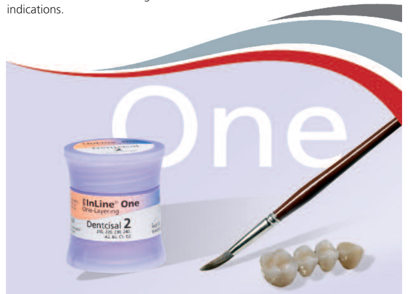
Veneering metal restorations in just one step with IPS InLine One

The IPS InLine system offers a range of system components which can be used for all three techniques. For example, the same opaquer is used regardless of the technique applied. Due to the compatible system components, the metal-ceramic system remains slim as regards the number of materials and at the same time offers high flexibility of use.