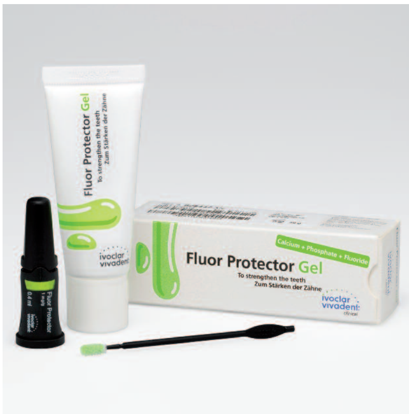
A strong duo: Fluor Protector varnish in the new VivAmpoule and the oral care gel Fluor Protector Gel.

The pleasant light mint taste and the perceptible smoothness of the teeth after the treatment with Fluor Protector Gel leave a good feeling in the mouth.