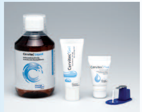
The Cervitec products keep bacteria in check.

The Cervitec products support the customized treatment of patients in the dental office and at home.